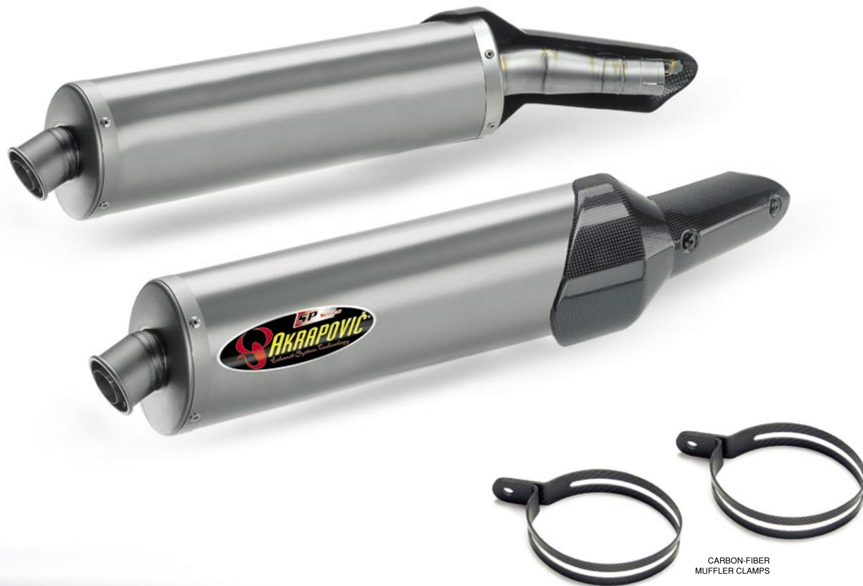
CARBON-FIBER MUFFLER CLAMPS