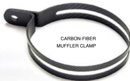
CARBON-FIBER MUFFLER CLAMP

Link pipe is made of stainless steel or sandblasted titanium (optional)