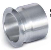
FIM MX 98 dB NOISE DAMPER