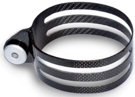
CARBON-FIBER MUFFLER CLAMPS