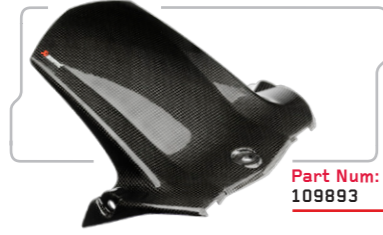
CARBON REAR FENDER