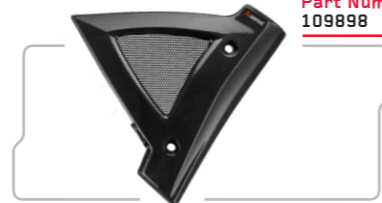
CARBON FRAME COVER - RIGHT