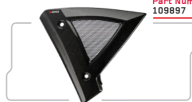
CARBON FRAME COVER - LEFT