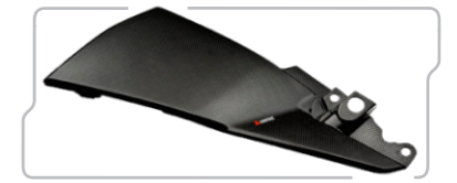
CARBON FUEL TANK SIDE PANEL - LEFT