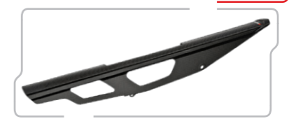
CARBON CHAIN GUARD