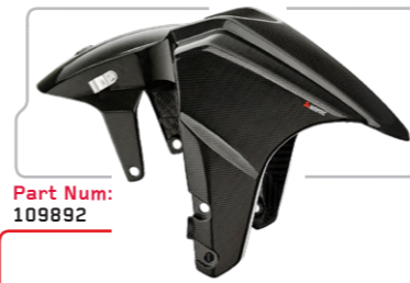
CARBON FRONT FENDER