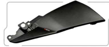
CARBON FUEL TANK SIDE PANEL - RIGHT