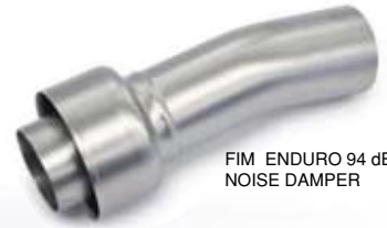
FIM ENDURO 94 dB NOISE DAMPER