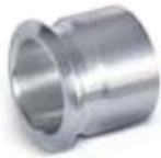
FIM MX 98 dB NOISE DAMPER