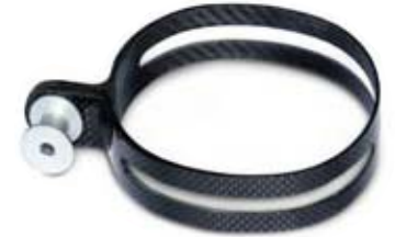
CARBON-FIBER MUFFLER CLAMPS