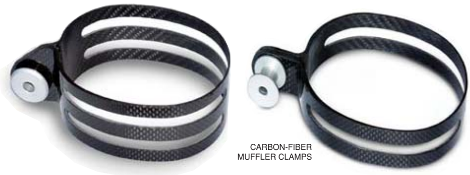
CARBON-FIBER MUFFLER CLAMPS